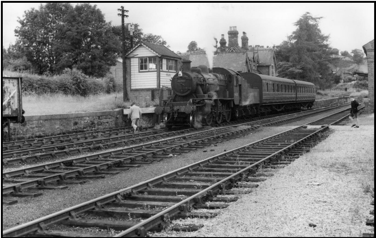
Llanfyllin with 46509 1 st August 1962 (49465)