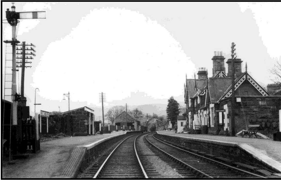
Cemmes Road 10 th April 1959 (49486)