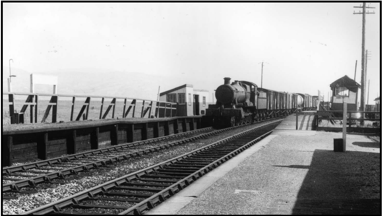
Ynyslas with 7801 7 th June 1963 (49514)

PMA1570 CAM Welshpool General view, 11-05-49, looking to Shrewsbury with Dukedog 4-4-0 No. 9017 entering station on passenger train. 49472 CAM Welshpool General view facing Shrewsbury, 30-07-58, with 43XX No. 6378 in platform on 3:45pm Shrewsbury to Aberystwyth service and 4-6-0 No. 7803 Barcote Manor in background on the Cambrian Coast Express . 49475 CAM Welshpool General view, 30-07-58, with Ivatt 2MT 2-6-0 in platform on Oswestry passenger service. 49473 CAM Welshpool General view facing Machynlleth, 18-04-62, with 4-6-0 No. 7809 Childrey Manor on up freight and 43XX No. 6339 and 4-6-0 No. 7810 Draycott Manor in background. 49474 CAM Welshpool General view facing Machynlleth, 18-04-62, with 4-6-0 No. 7810 Draycott Manor on 5:30pm to Shrewsbury and 43XX No. 6339 in bay. Both locos seen headon. 50984 CAM/GCR Wrexham Central General view, circa 1960s, showing the platforms 3 & 4, looking west towards Wrexham Exchange. 56786 CAM/GCR Wrexham Central General view, circa 1960s, showing the GCR terminal platforms and station buildings, with the GWR platforms visible to the right. 56787 CAM/GCR Wrexham Central General view showing the GCR platforms, looking west towards the Bradley road overbridge circa 1960s. 49514 CAM Ynyslas General view, 7-06-63, facing Dovey Junction with Manor No. 7801 Anthony Manor approaching on freight. 49515 CAM Ynyslas General view, 7-06-63, facing Aberystwyth along the platform showing the burnt out signal box.