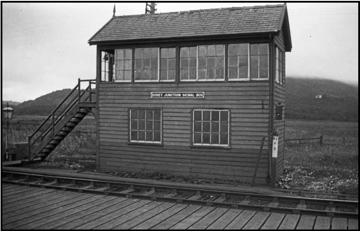
Dovey Junction Signal Box 1930s (67304)