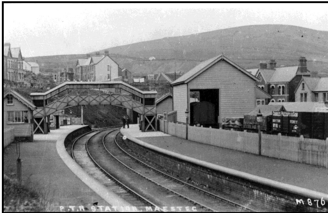
Maesteg PTR, circa 1912 (52721)