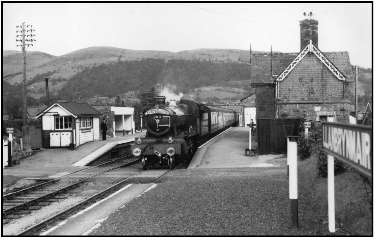
Llanbrynmair with 7811 on the down Cambrian Coast Express 10 th April 1959 (neg 49463)

LENS OF SUTTON ASSOCIATION List 13 (Issue 3 June 2018)