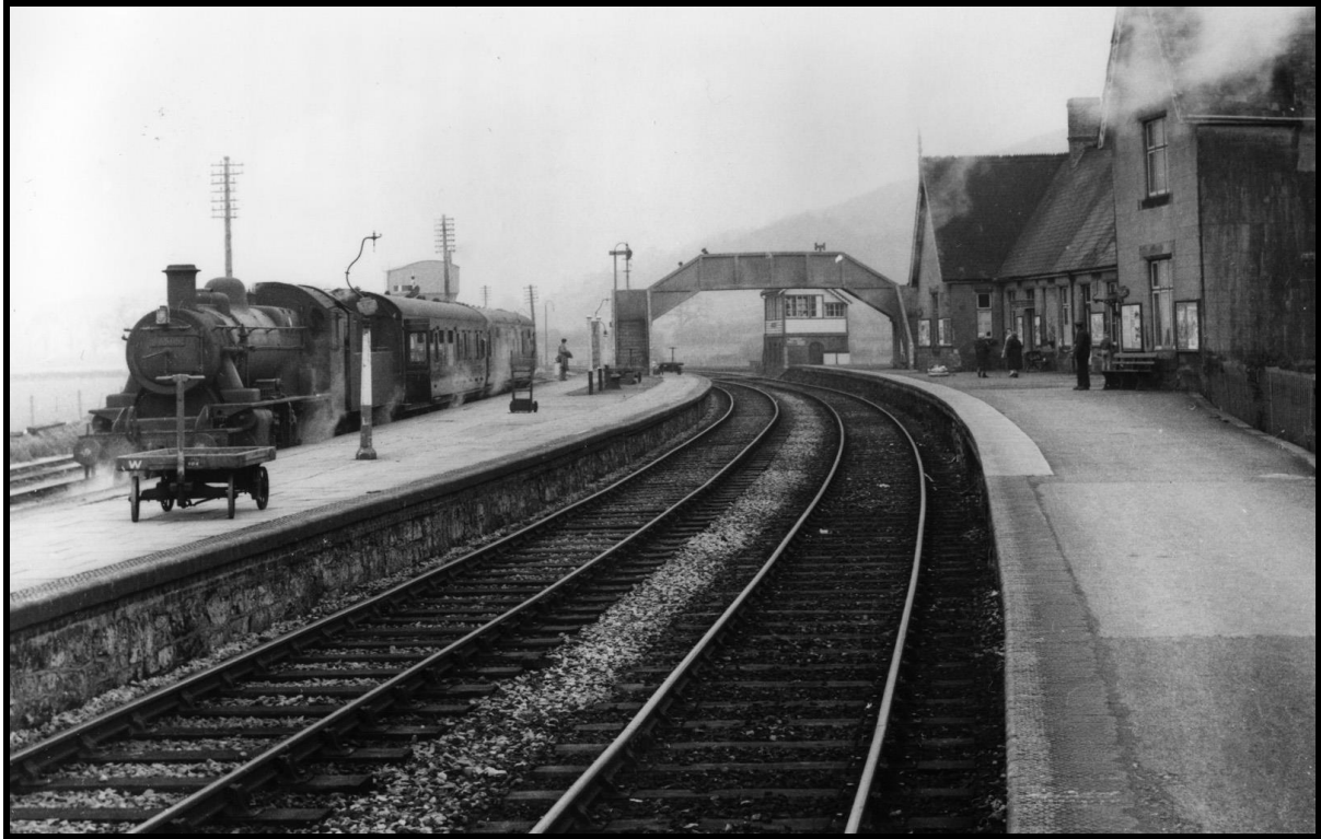
49467 Moat Lane with 46505 18 th April 1962 (49467)

PMA1619 CAM Moat Lane Junction General view, 13-05-49, looking to Welshpool with Dean Goods 0-6-0 No. 2482 standing in front of the station building on a service to Brecon. PMA1627 CAM Moat Lane Junction General view from footbridge, 13-05-49, looking to Machynlleth with 4-6-0 No. 7808 Cookham Manor entering station on an eastbound express. 49467 CAM Moat Lane Junction General view, 18-4-62, facing Welshpool looking across platforms to Ivatt 2MT No. 46505. 49468 CAM Moat Lane Junction General view, 18-14-62, facing Welshpool with Manor No. 7823 Hook Norton Manor heading the down Cambrian Coast Express .