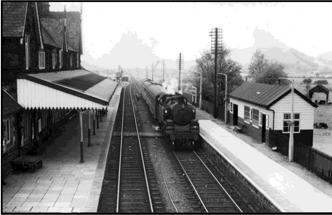
Machynlleth with 82006 on up service 7 th June 1963 (49501)