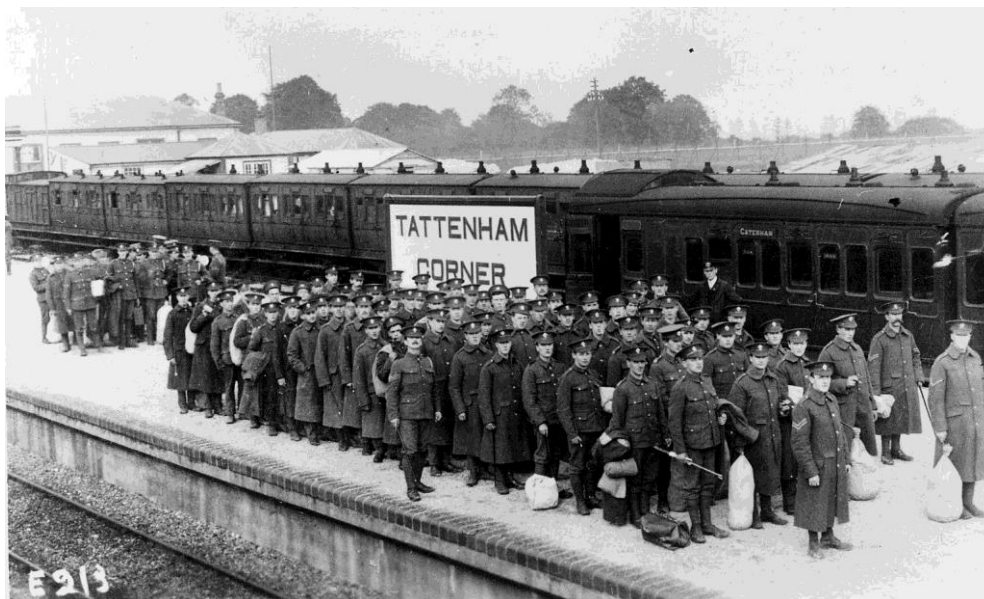
Tattenham Corner c1914 (20201)