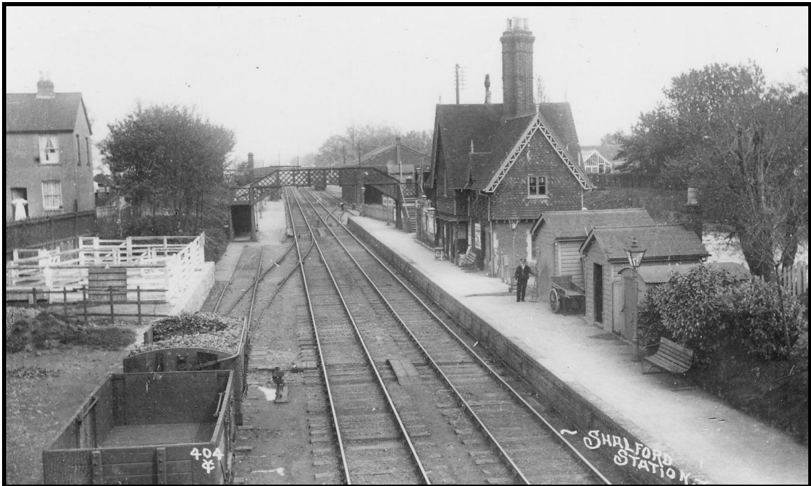
Shalford c1920 (20275)

LENS OF SUTTON ASSOCIATION List 15 (Issue2 Dec 2009)