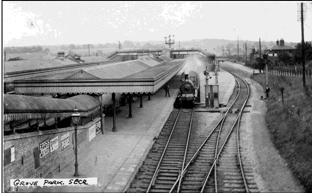
Grove Park c1910 (20379)