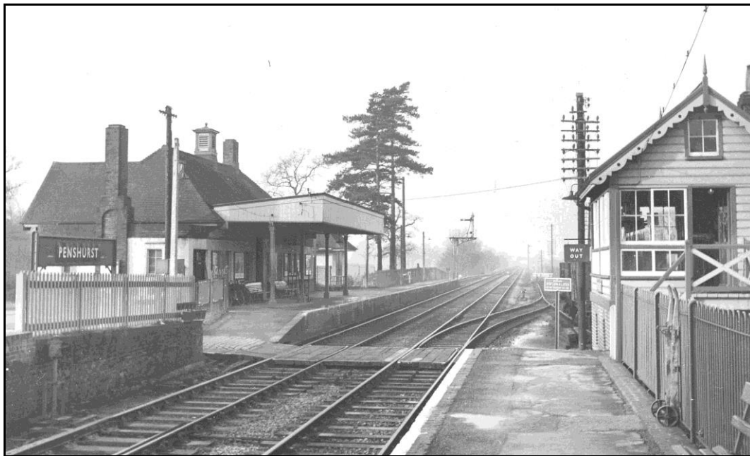
Penshurst 5/1/52 (Denis Cullum C1198)