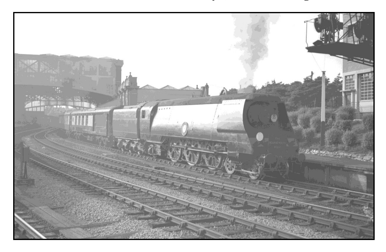
21C12 United States Line between 10/46 and 1/49 at Bournemouth Central (60388)

60221 21C1 Channel Packet c.1941 L3/4f Exmouth Jt Shed; as originally built in Works grey COPY