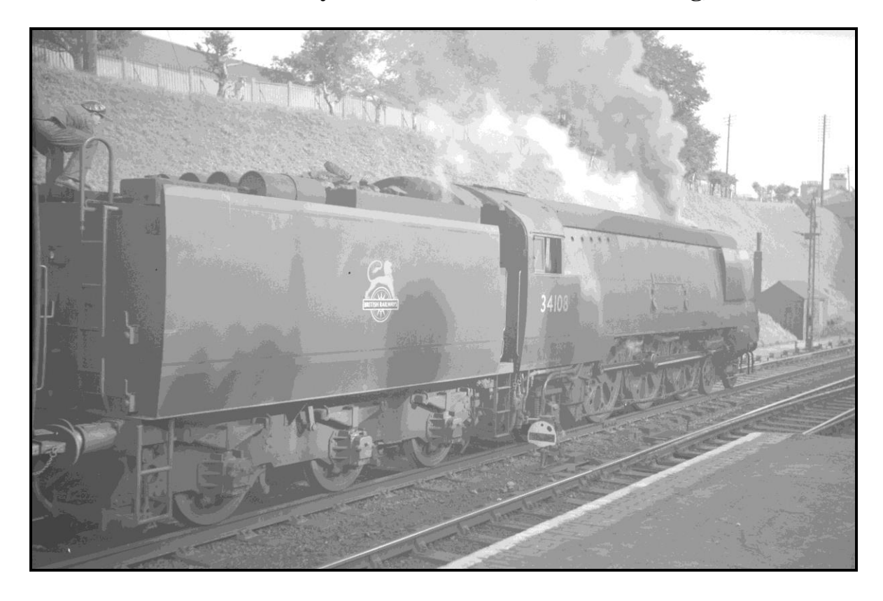
34108 Wincanton during the early 1950s, possibly at Winchester City (60164)

60712 34002 Salisbury c1966 R3/4f distant view running through countryside