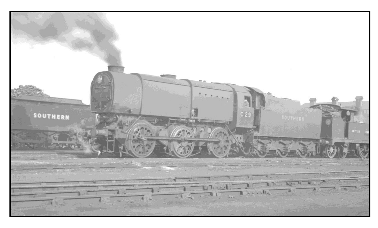
C29 at Ashford Shed in about 1948/9 (60245)