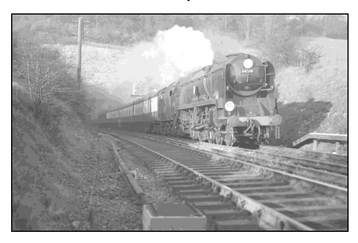
34013 Okehampton in the period 10/57-4/60, possibly at Polhill Tunnel (60744)

60809 34001 Exeter c59 L3/4f Margate awaiting departure (Frank Saunders)