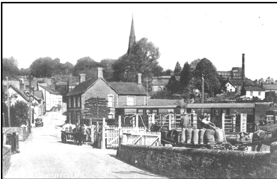
Uffculme c1912 (53443)

64506 GWR Tiverton Junction c1960s View with 43XX 2-6-0 7337 on short freight standing in platform.