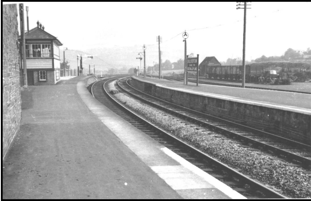
Dulverton c1960 (53466)

53358 GWR Donyatt Halt General view, circa 1959, showing single platform, waiting shelter and road overbridge.