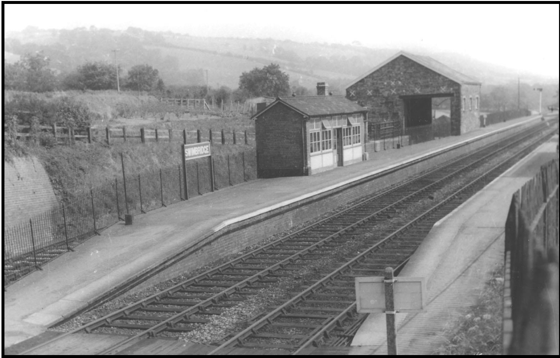
Swimbridge in the 1950s (53497)