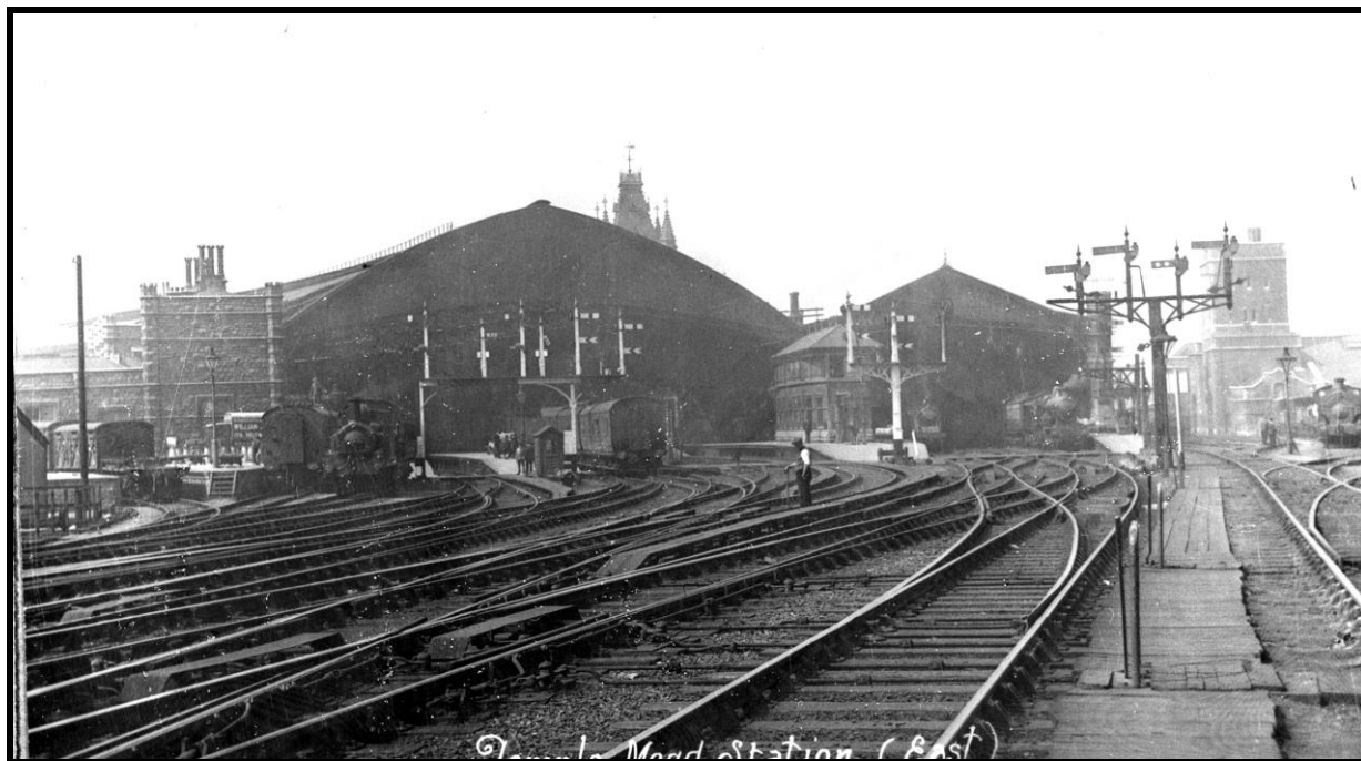
Bristol Temple Meads c1912 (53001)

53302 GWR Brislington General view, circa 1960s, showing single platform and station building.