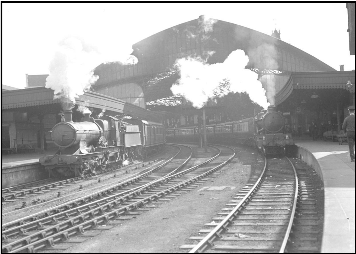
Bristol Temple Meads (53004)

LENS OF SUTTON ASSOCIATION List 21 (Issue 3 February 2018)