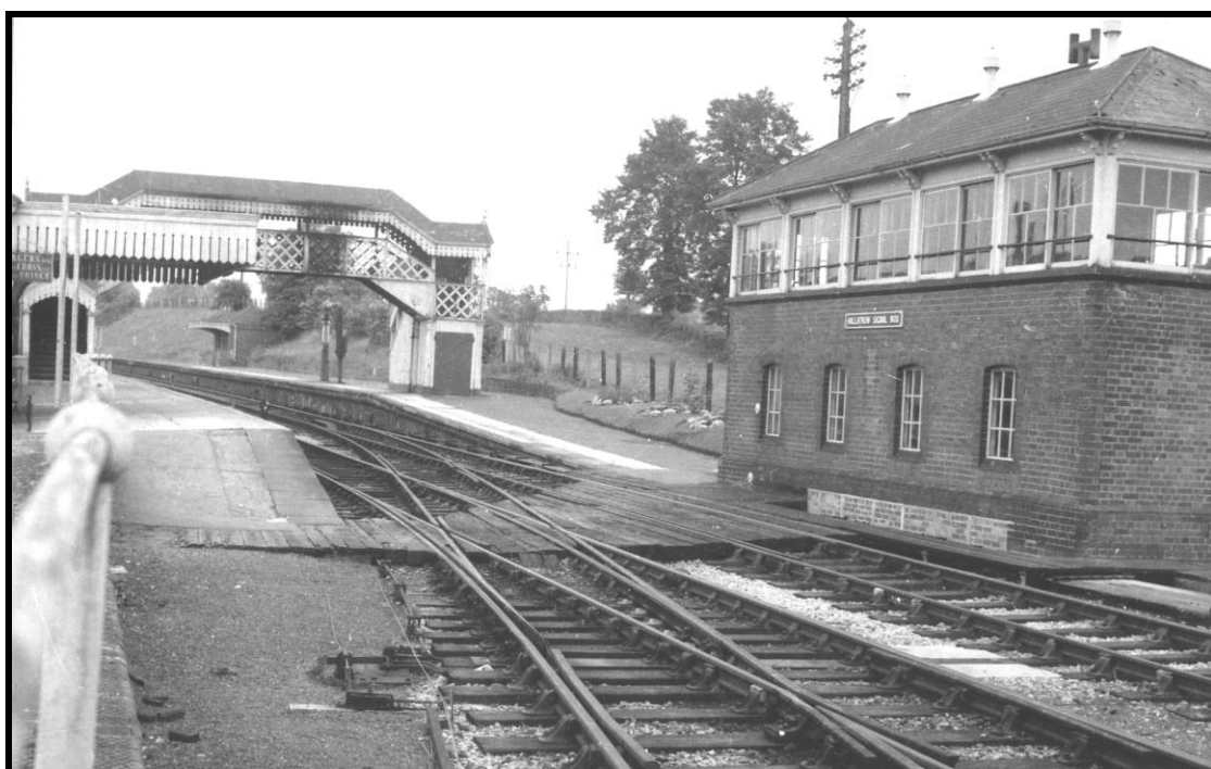
Hallatrow c1960 (53320)