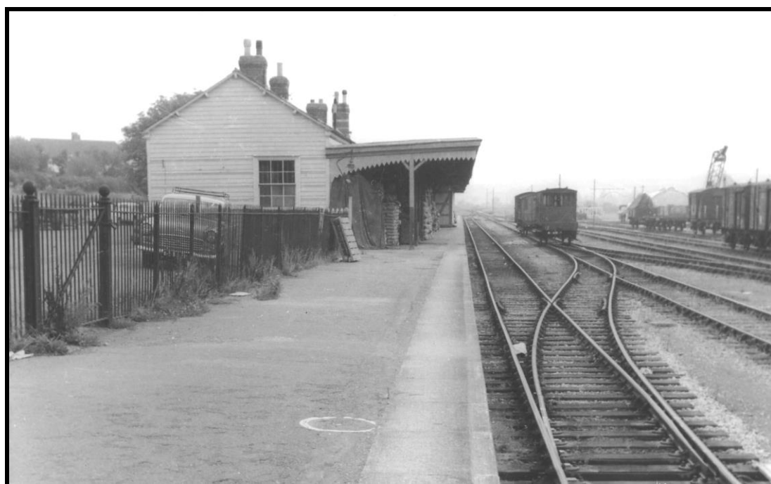
Barnstaple Victoria c1960 (53341)