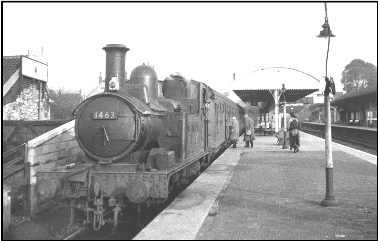
Yatton 10th January 1959 (53084)

53095 GWR Yatton General view, circa 1960s, showing up and down platforms, station buildings and footbridge.