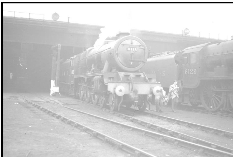
LMS 6112 Sherwood Forester , circa late 1940s (24049)

24044 LMS 6100 Royal Scot late 30's R3/4f shed view, fitted parallel boiler, deflectors and Fowler tender