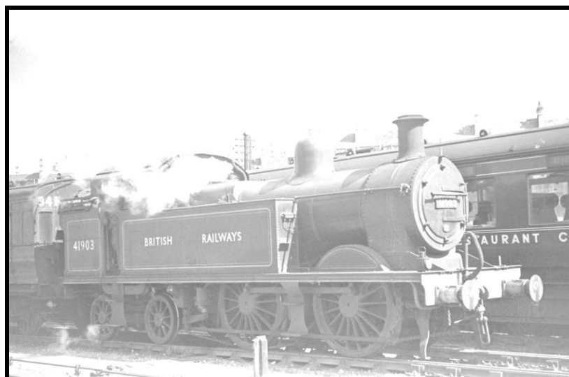
41903 circa 1948/9 (23259)