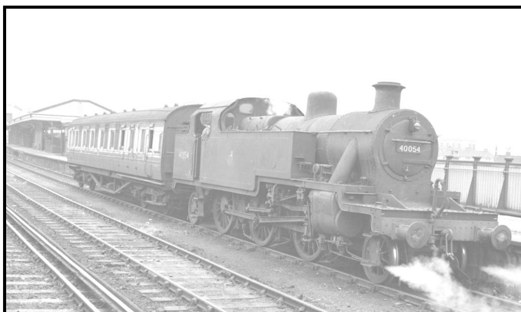
40054 at Clapham Junction c1954 (23052)