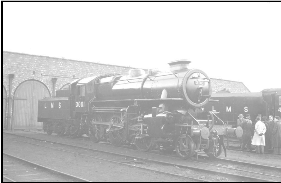
LMS 3001 circa 1947 at Crewe Works (23475)