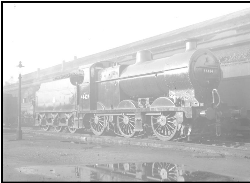
44424 at Derby in March 1951 (65110)