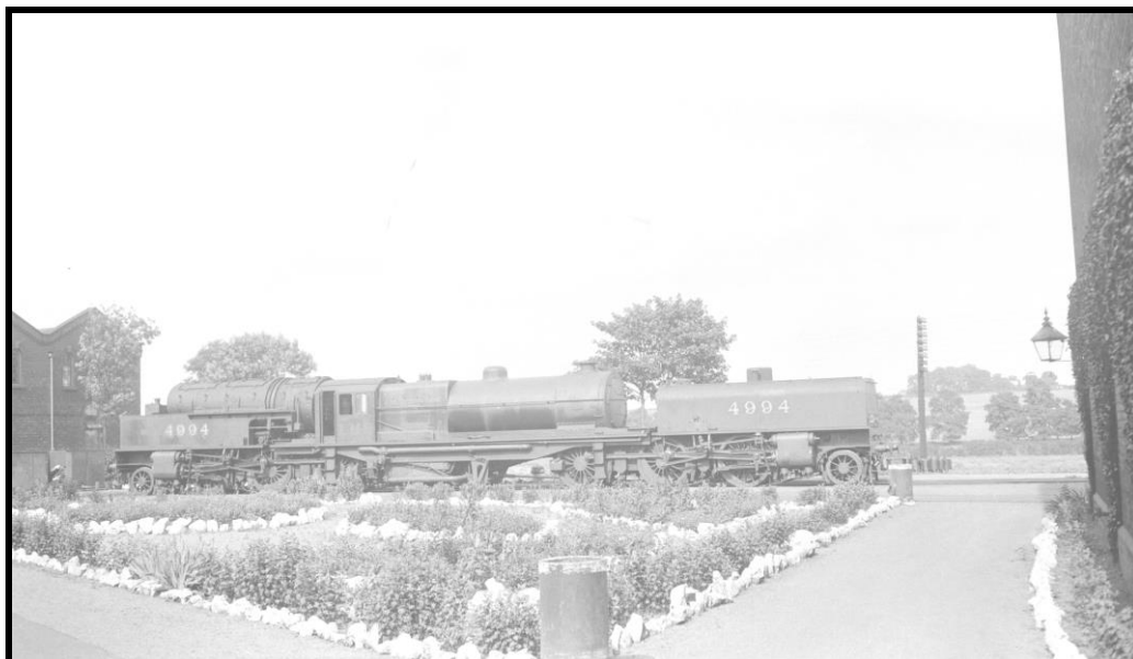
LMS 4994 at Wellingborough in the early 1930s (24275)