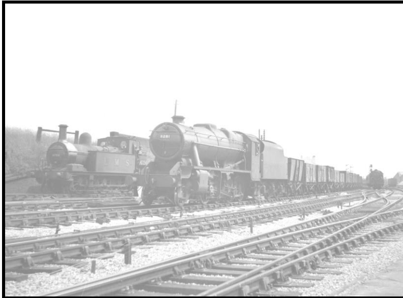
LMS 8282 circa 1948 (24303)