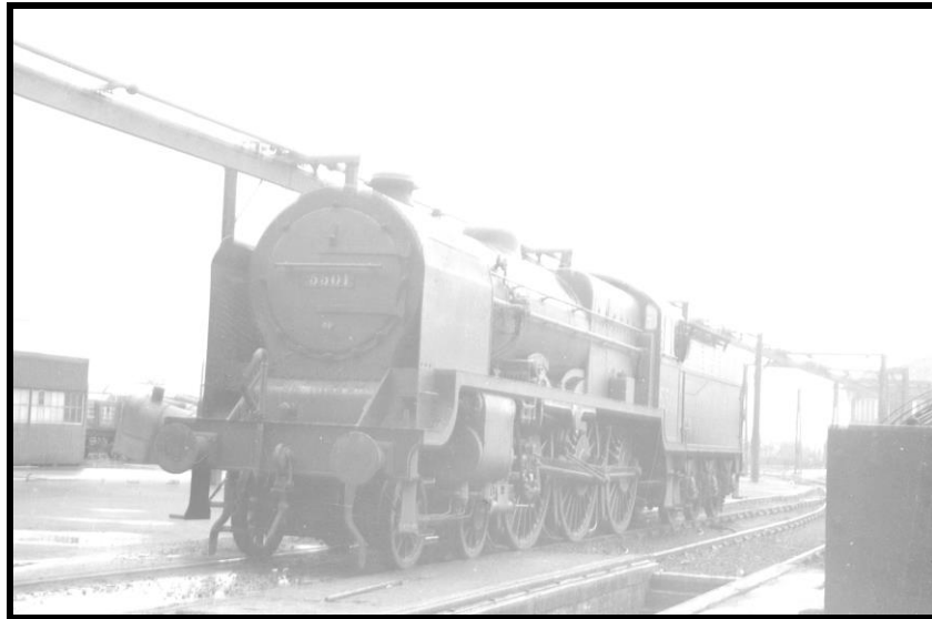
LMS 5501 at Crewe, circa 1935 (23918)