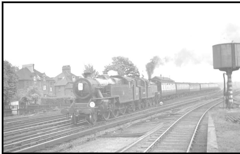
42084 and 42097 at Sutton, circa mid 1950s (23331)

23260 LMS 2189 2.10.48 R3/4f Low Moor Shed 23261 LMS 2281 c1947 L3/4f shed view 23262 LMS 2289 c1947 L3/4f shed view 24536 BR 42052 c1963/4 L3/4f Leeds City (Wellington) (Frank Saunders) 24537 BR 42052 c1963/4 L3/4f passing Leeds City (Wellington) signal box (Frank Saunders) 23263 BR 42055 c1966 L3/4f yard view 23264 BR 42066 c1954 R3/4f Clapham Junction Station? Station view 23265 BR 42066 c1954 L3/4f East Croydon Station 23266 BR 42069 c1954 L3/4f Ashford Shed 23267 BR 42070 c1962 R3/4f Great Missenden 23268 BR 42070 c1950 L3/4f Brighton Shed, possibly new 23269 BR 42070 c1960 L3/4f station view, wrong line working 24456 BR 42070 c1961 HO station view, GC/Met line 24457 BR 42070 c1961 L3/4f station view, GC/Met line 23270 BR 42071 c1951 R3/4f Ashford Shed 23271 BR 42071 c1962 R3/4f Willesden Shed 23272 BR 42072 c1951/2 L3/4f Ashford Shed 23273 BR 42072 c1962 R3/4f shed view 23274 BR 42072 c1966 L3/4f shed view