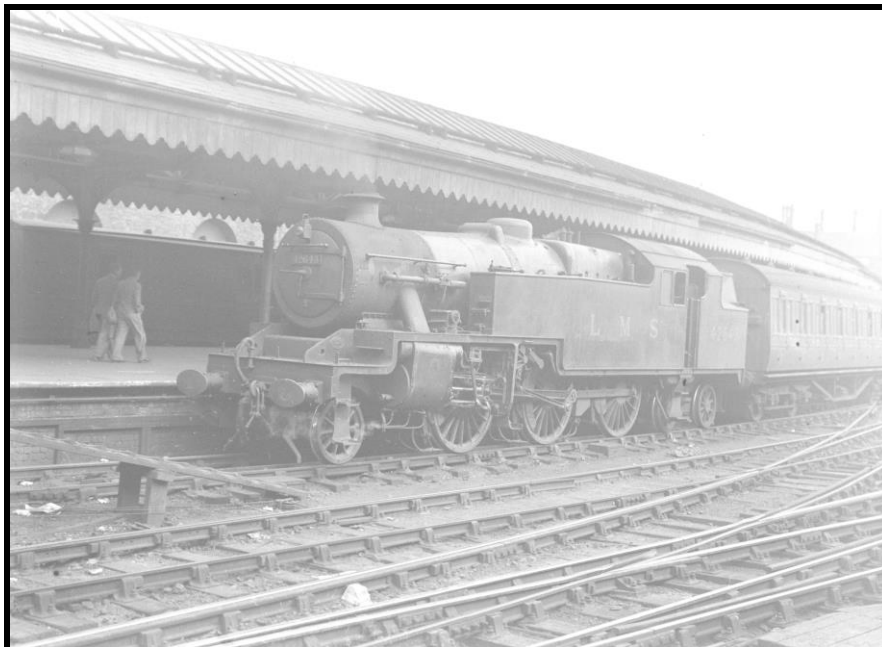
42643 at Preston circa 1949 (65100)

23367 LMS 2430 late 40's R3/4f lineside working local passenger 23368 LMS 2443 late 30's L3/4f Watford Shed 23369 LMS 2451 late 30's L3/4f shed view 23370 LMS 2477 late 30's R3/4f lineside between Craven Arms-Shrewsbury, working local passenger