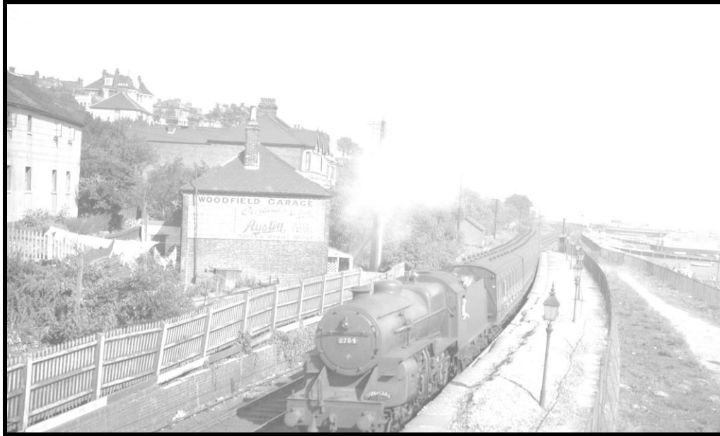
LMS 2754 in late 1930s (23425)