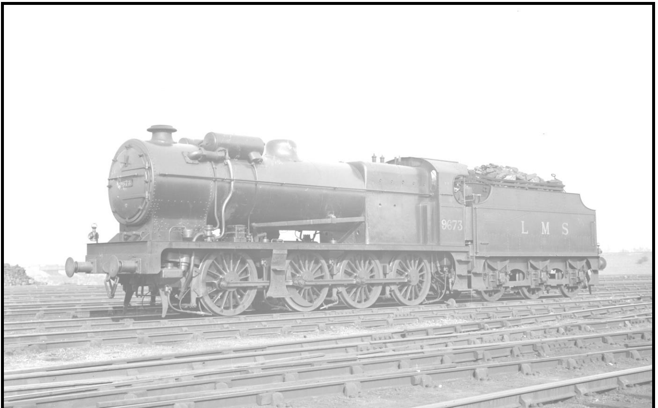
LMS 9673 circa 1930s (24445)

LENS OF SUTTON ASSOCIATION List 22 (Issue 2 November 2009)