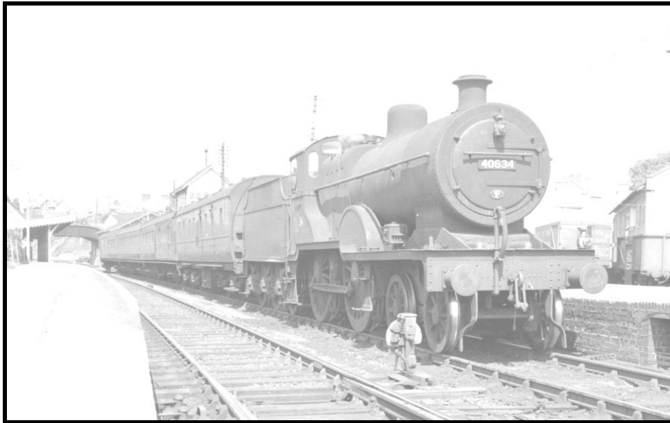
40634 at Blandford Forum circa 1960 (23105)