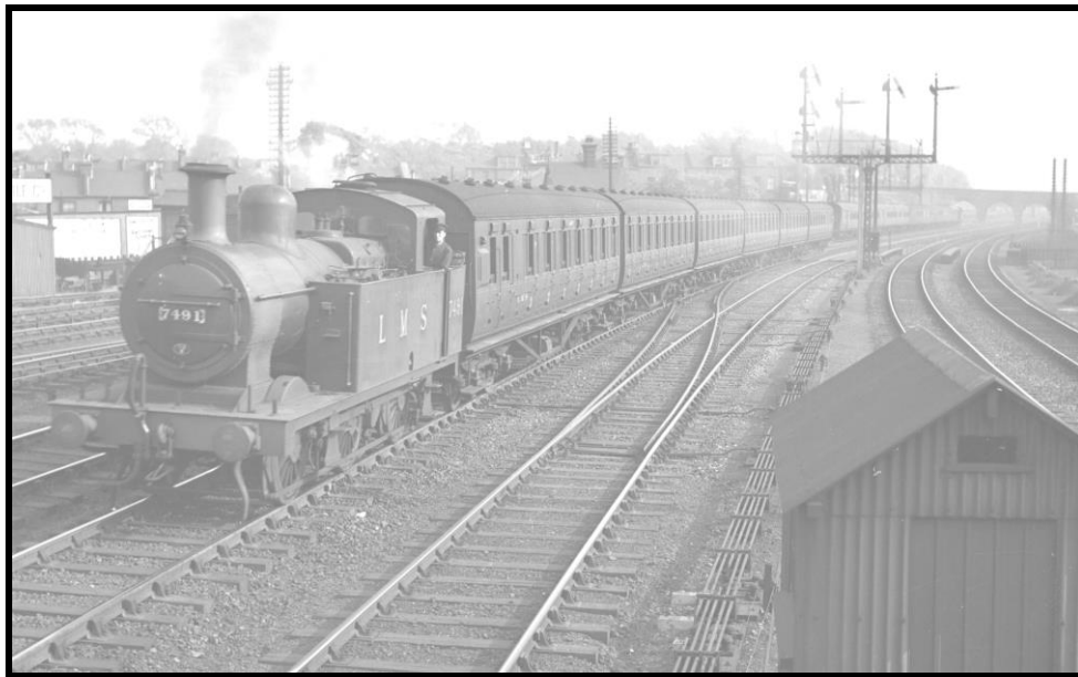
LMS 7491 circa late 1930s (24230)

24197 LMS 16407 early 30's RHS shed view 24198 LMS 16410 early 30's L3/4f shed view 24199 LMS 16422 early 30's L3/4f yard portrait 24200 LMS 16424 late 20's R3/4f shed view 24201 LMS 16436 early 30's R3/4f station view standing light engine; carrying target 668 24202 LMS 16456 early 30's L3/4f station view at head of coaching stock 24203 LMS 16514 early 30's LHS shed view 24204 LMS 16516 early 30's R3/4f shed view 24205 LMS 16536 early 30's LHS shed view 24206 LMS 16550 early 30's L3/4f shed view 24207 LMS 16565 early 30's RHS yard view shunting 24208 LMS 16570 early 30's L3/4f yard view shunting NEG BLURRED 24209 LMS 16602 early 30's L3/4f shed view 24210 LMS 16620 early 30's L3/4f Glasgow St. Enoch Shed 24211 LMS 16647 early 30's R3/4f shed view 24212 LMS 16685 early 30's R3/4f shed view 24213 LMS 16739 early 30's R3/4f shed view 24214 LMS 16741 early 30's RHS shed view 24215 LMS 16760 early 30's L3/4f shed view 24216 LMS 7101 c1935 R3/4f lineside view heading freight; carrying square discs instead of headlamps 24217 LMS 7101 c1935 L3/4f Kentish Town Shed 24218 LMS 7145 c1935 LHS shed view