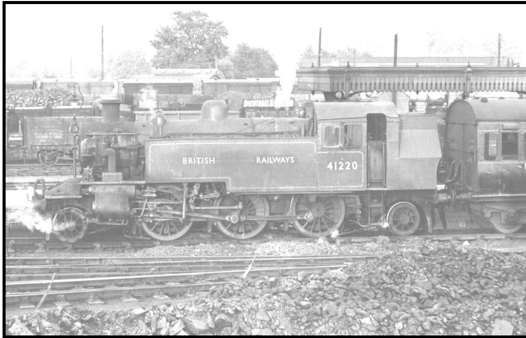
41220 at Watford Junction c1948 to 1950 on St Albans motor train (24450)