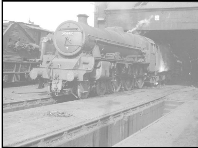
45613 Kenya, circa 1963/4 (24020)