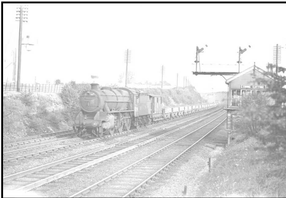
42961 circa 1948/9 in Tring Cutting (23470)

23460 LMS 13247 3.8.35 R3/4f Preston Shed 23461 LMS 13263 3.3.35 R3/4f Crewe South Shed 23462 LMS 13265 c1935 L3/4f Kentish Town Shed 23463 LMS 13270 c1935 R3/4f shed view 23464 LMS 2946 late 30's L3/4f shed view 23465 LMS 2949 late 30's LHS shed view 23466 LMS 2951 late 30's R3/4f lineside, passing on class H freight 23467 LMS 2965 late 30's L3/4f shed view 23468 LMS 2979 late 30's L3/4f shed view 24556 BR 42956 c1954 R3/4f shed view (Frank Saunders) 23469 BR 42960 c1954 L3/4f lineside, heading local passenger 23470 BR 42961 c1948/9 L3/4f Tring Cutting, heading Class H engineers' train 24557 BR 42966 c1961 R3/4f Willesden Shed (Frank Saunders) 23471 BR 42968 c1964 R3/4f shed view 23472 BR 42983 c1963 RHS Swindon Works Yard