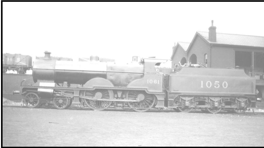
LMS 1061 circa early 1930s (23133)