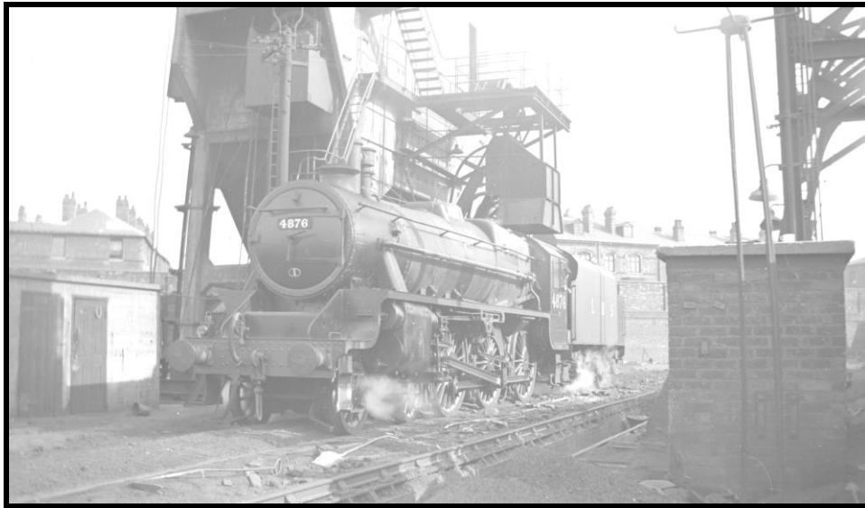
LMS 4876 at Aston, circa 1946/7 (23621)

23611 LMS 4767 1947 L3/4f Crewe Works Yard 23612 LMS 4810 1947 R3/4f Saltley Shed 23613 LMS 4824 c1946/7 L3/4r shed view 23614 LMS 4826 c1947/8 L3/4f Bournemouth West 23615 LMS 4830 c1946/7 R3/4f lineside, heading local passenger 23616 LMS 4849 c1947/8 L3/4f Kentish Town Shed 23617 LMS 4853 c1946/7 R3/4f lineside, heading express passenger 23618 LMS 4855 c1947/8 L3/4f Bournemouth West 23619 LMS 4858 c1946/7 L3/4f lineside, heading Class F Freight 23620 LMS 4870 c1946/7 RHS shed view 23621 LMS 4876 c1946/7 L3/4f Aston Shed 23622 LMS 4882 c1946/7 L3/4f lineside, heading express passenger 23623 LMS 4963 c1946/7 R3/4f Bristol Temple Meads 23624 LMS 4964 c1946/7 R3/4f Station view, heading express passenger 23625 LMS 4984 c1946/7 R3/4f Elstree Station 23626 LMS 4984 c1946/7 R3/4f Elstree Station 23627 LMS 4984 c1946/7 L3/4f Kentish Town Shed 23628 LMS 4997 1947 L3/4f shed view 23629 LMS 5003 3.3.35 R3/4f Crewe Works Yard 23630 LMS 5011 c1946/7 L3/4f Tain Station 23631 LMS 5018 13.3.35 R3/4f Crewe Works Yard, engine only 23632 LMS 5024 late 30's L3/4f shed view 23633 LMS 5027 c1946 R3/4f lineside, heading Class F Freight