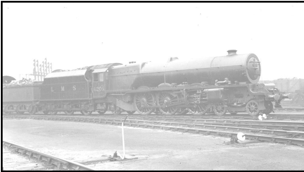
LMS 6205 Princess Victoria at Camden in late 1930s (24118)