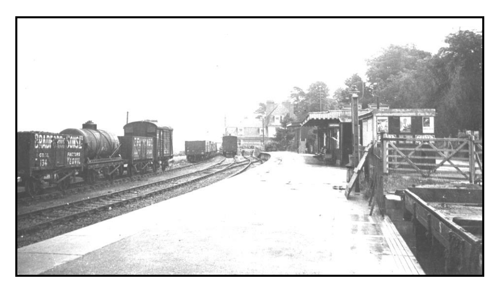
Lyme Regis in 1930s (39469)

39034 LSWR Lyme Regis General view, circa 1960s, looking southwards with a mixed train alongside the main platform.