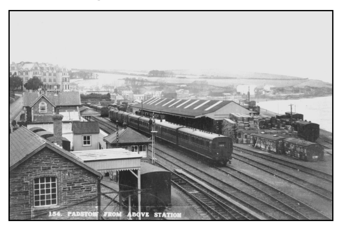
Padstow in 1920s (39334)

38582 LSWR Padstow General view, circa 1960s, showing 'T9' class 4-4-0 No.30717 with an up passenger train. 38583 LSWR Padstow General view, circa 1960s, showing the single platform and station building, looking north towards the terminal buffer stops.