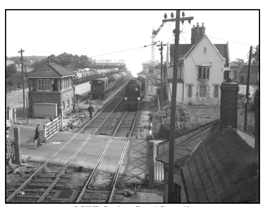
LSWR Stations Part 1 Page 49

39325 LSWR Wadebridge Detailed view, circa 1950s, showing 'T9' class 4-4-0 No.30712.