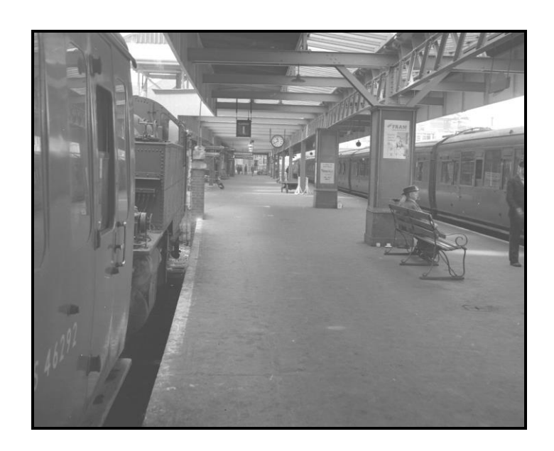
Exeter Central in 1960s (39069)

56400 LSWR/GWR Yeovil Town Postcard view, circa 1912, showing interior of train shed.