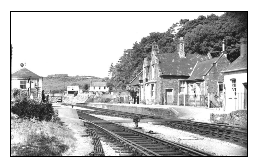
Kings Nympton 03-08-55 (D Cullum 2636)

38738 LSWR Kings Nympton General view, circa 1970s, showing main station building.