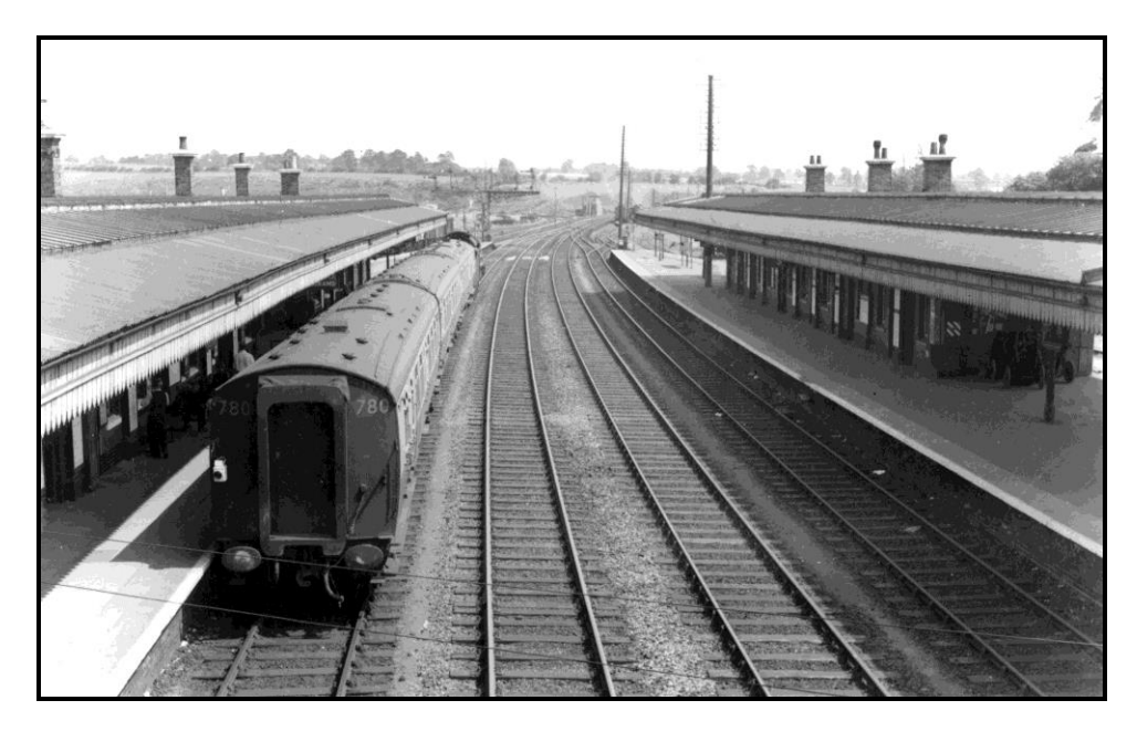
Yeovil Junction in 1950s (20708)

39157 LSWR Yeovil Junction General view, circa 1960s