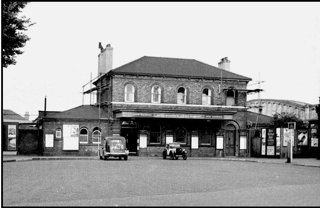
Kew Gardens (85865)

86065 LSWR/LNWR Kew Bridge General view, circa 1960s, showing Kew Bridge Junction and signal box, looking west towards Feltham.