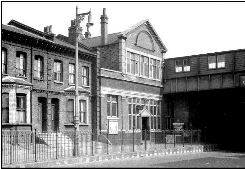
Queenstown Road, Battersea (85845)

86202 LSWR/DIST Ravenscourt Park Postcard view, circa 1912, showing up and down platforms and station buildings.