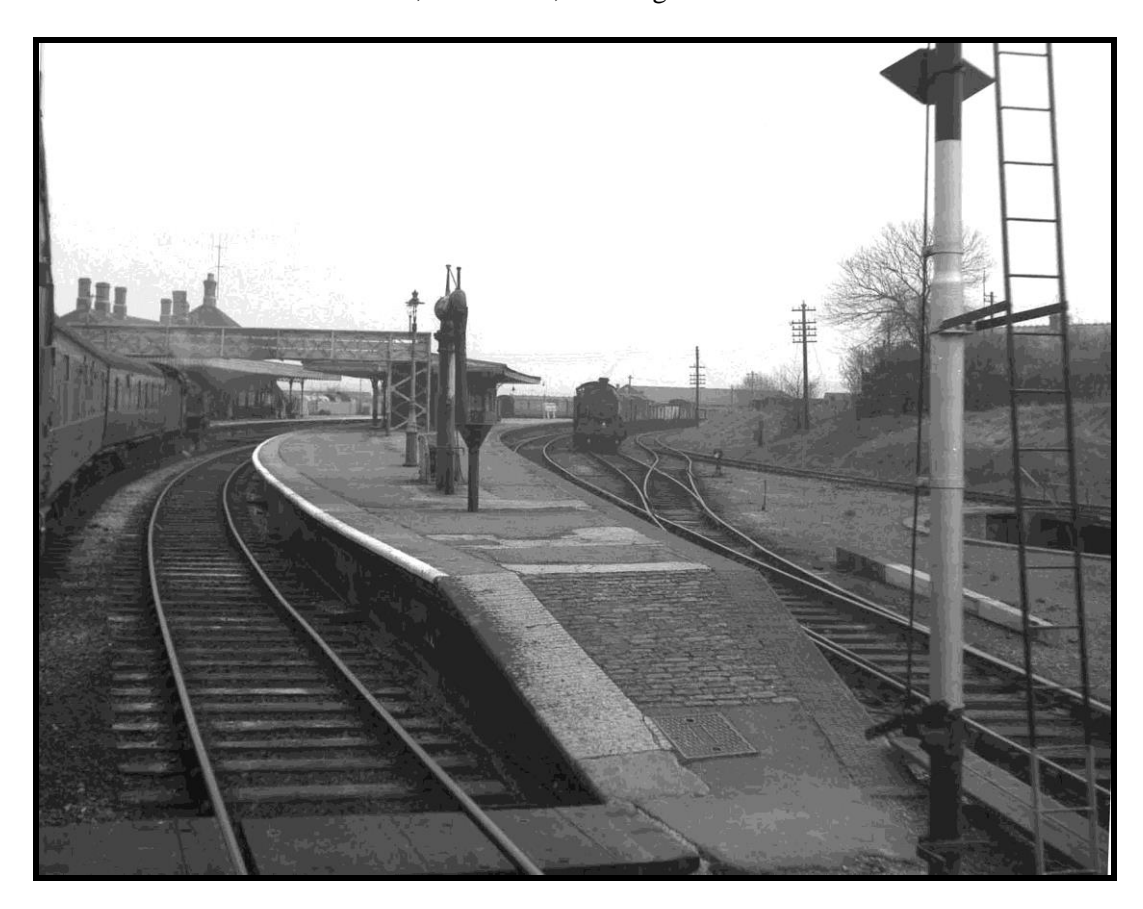
64722 Swindon Town c1950s

56077 MSWJ Swindon Town Detailed view, circa 1950, showing former MSWJ offices.