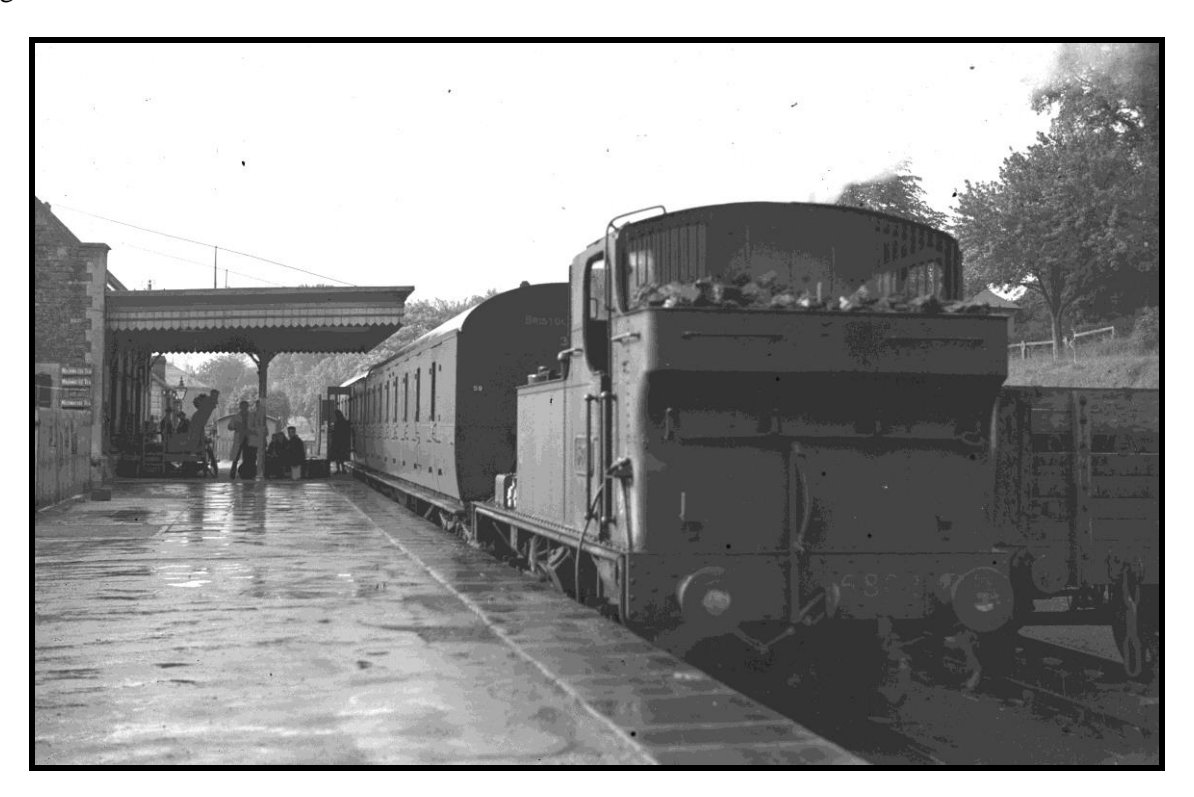
66087 Malmesbury in 1948

56040 MSWJ Marlborough Low Level General view, 22-05-1938, showing '45XX' class 2-6-2T No.4590. 56041 MSWJ Marlborough Low Level Postcard view, circa 1906, showing up and down platforms and station buildings.