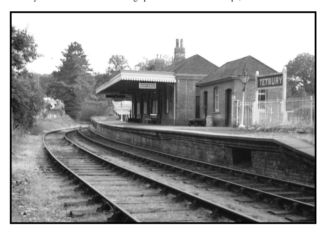
56384 Tetbury circa 1964

59357 GWR Thatcham General view, circa 1960s, showing details of main station building.