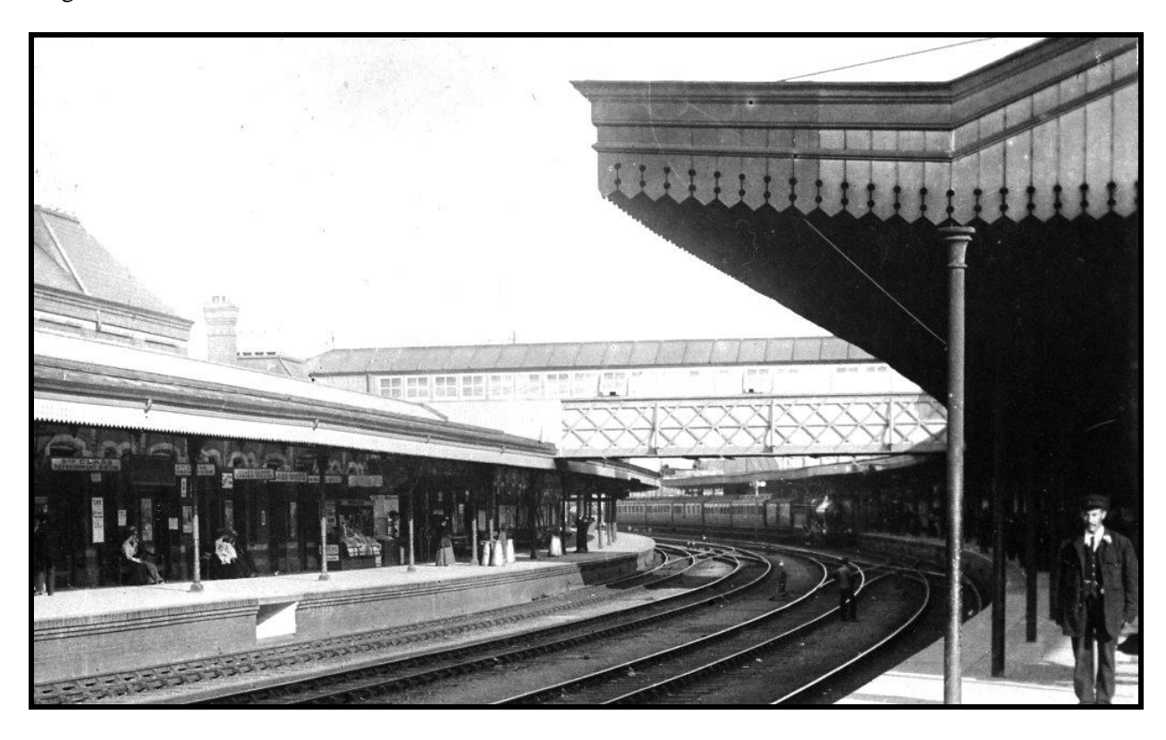
57372 Gloucester Central circa 1912

57372 GWR Gloucester Central Postcard view, circa 1912, showing up and down platforms, station buildings and footbridge.