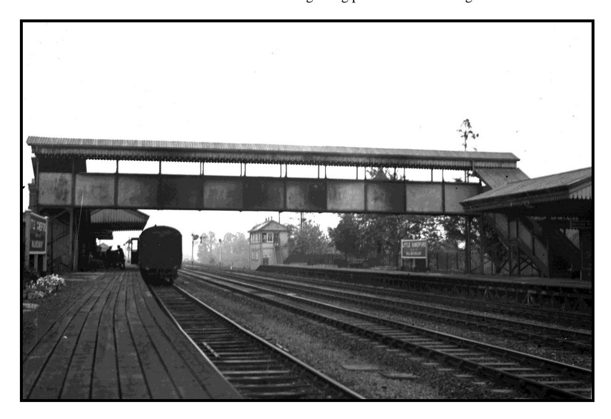
66068 Little Somerford c1948

66068 GWR Little Somerford General view c1948 looking along platform to footbridge