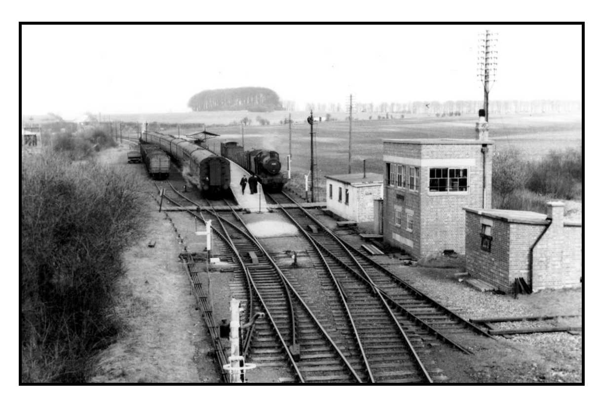
56151 Worthy Down circa 1962

56151 GWR Worthy Down General view, circa 1962, showing trains passing on either side of island platform and ARP-type signal cabin.