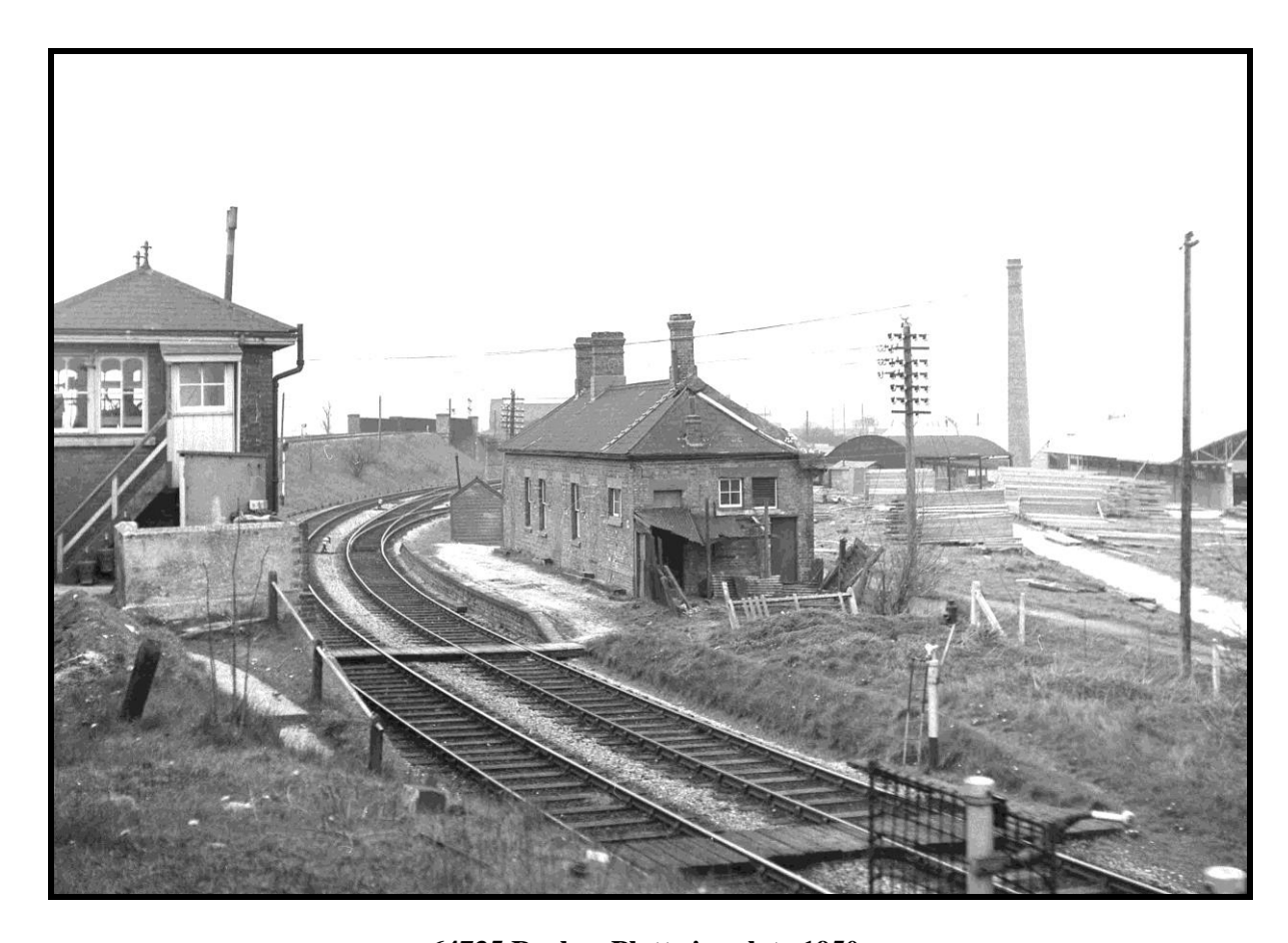
64735 Rushey Platt circa late 1950s

20861 GWR/LSWR Rodwell Postcard view, circa 1910, looking north towards Weymouth.