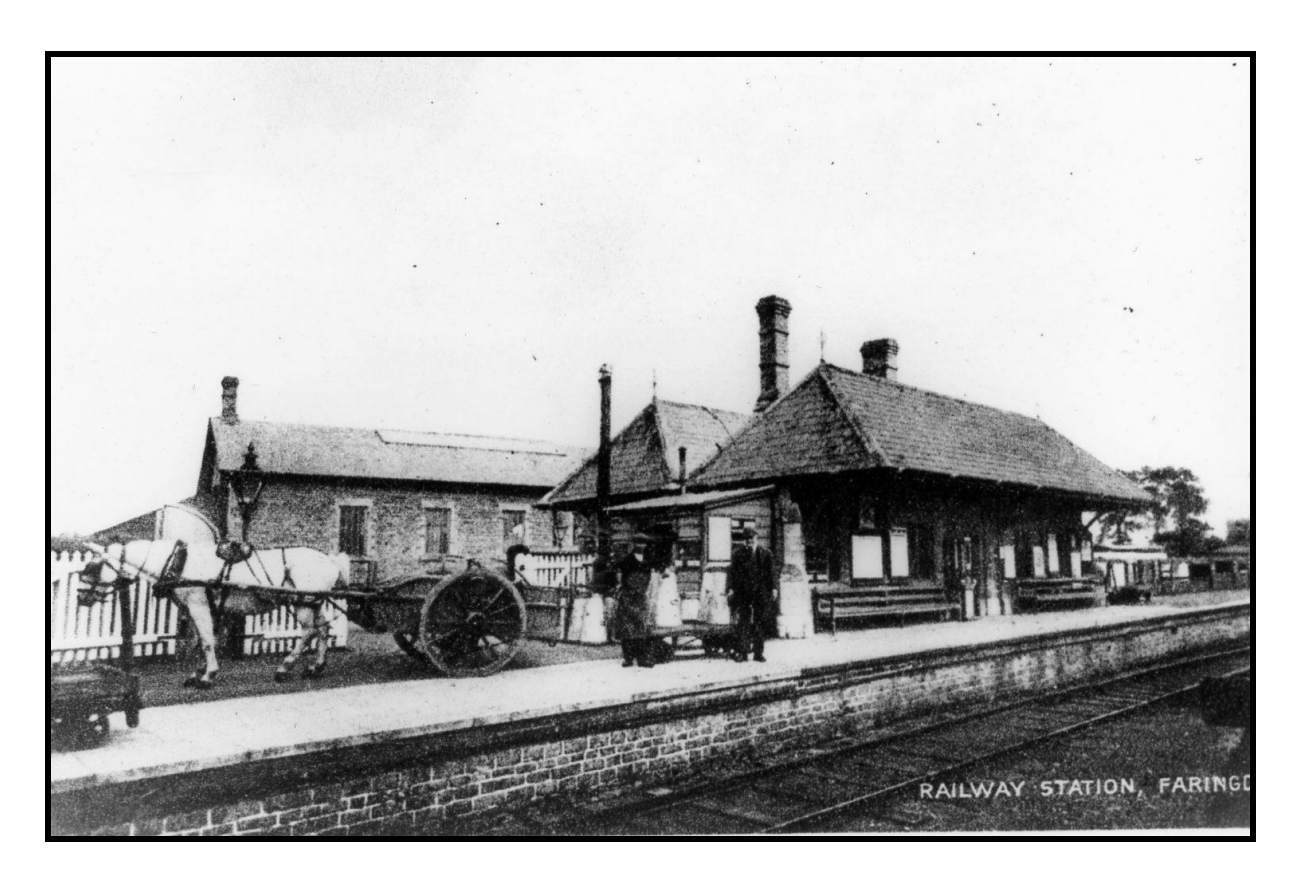
59104 Farringdon circa 1912

56018 MSWJ Foss Cross General view, circa 1960s, showing up and down platforms and station buildings, with Gloucestershire Railway Society special.