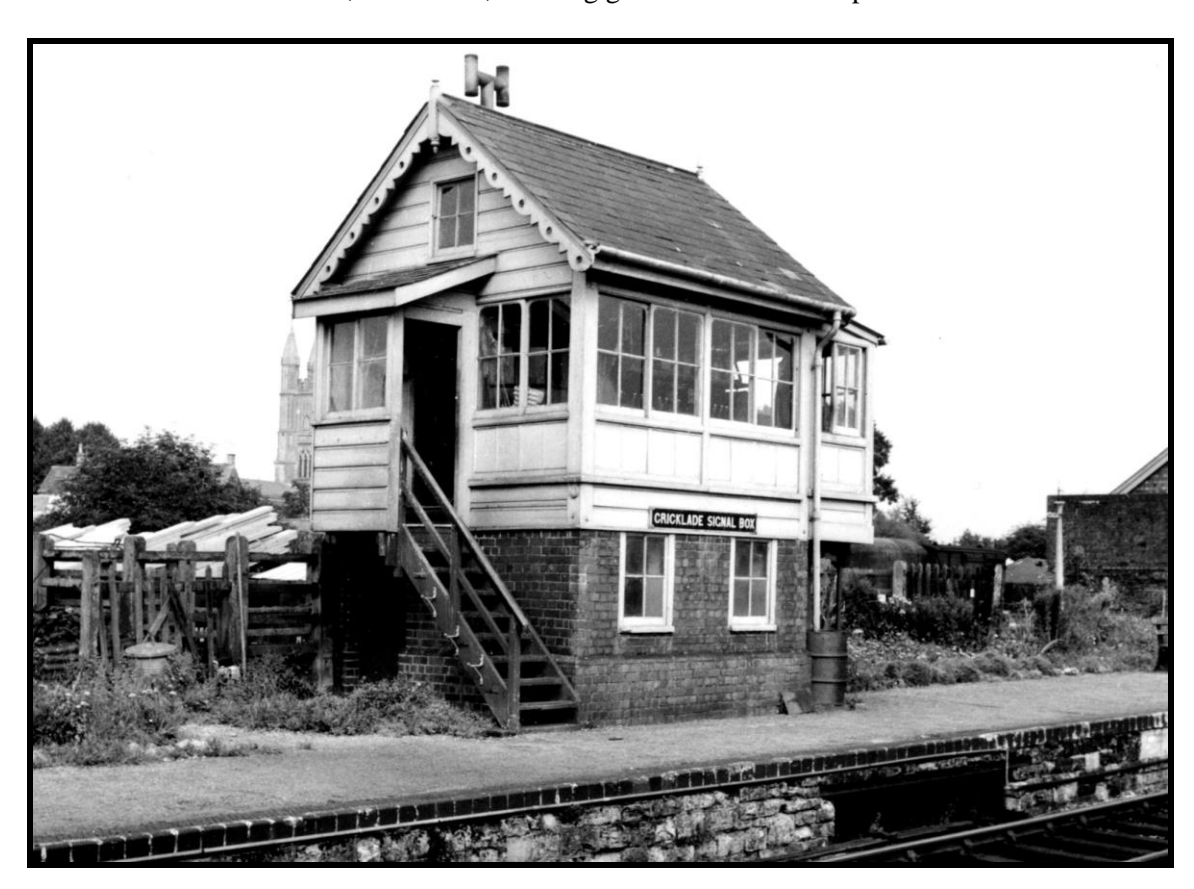
56073 Cricklade Signal Box circa 1960

59940 GWR Corsham General view, circa 1962, showing up and down platforms, station buildings and footbridge. 59941 GWR Corsham General view, circa 1962, showing goods shed from the platforms.