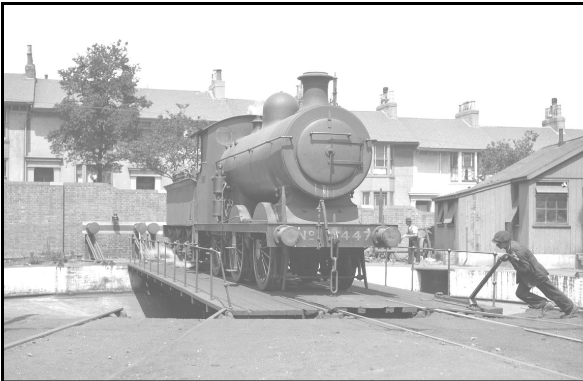
LBSC 447, C2X class, at Brighton MPD (69667)