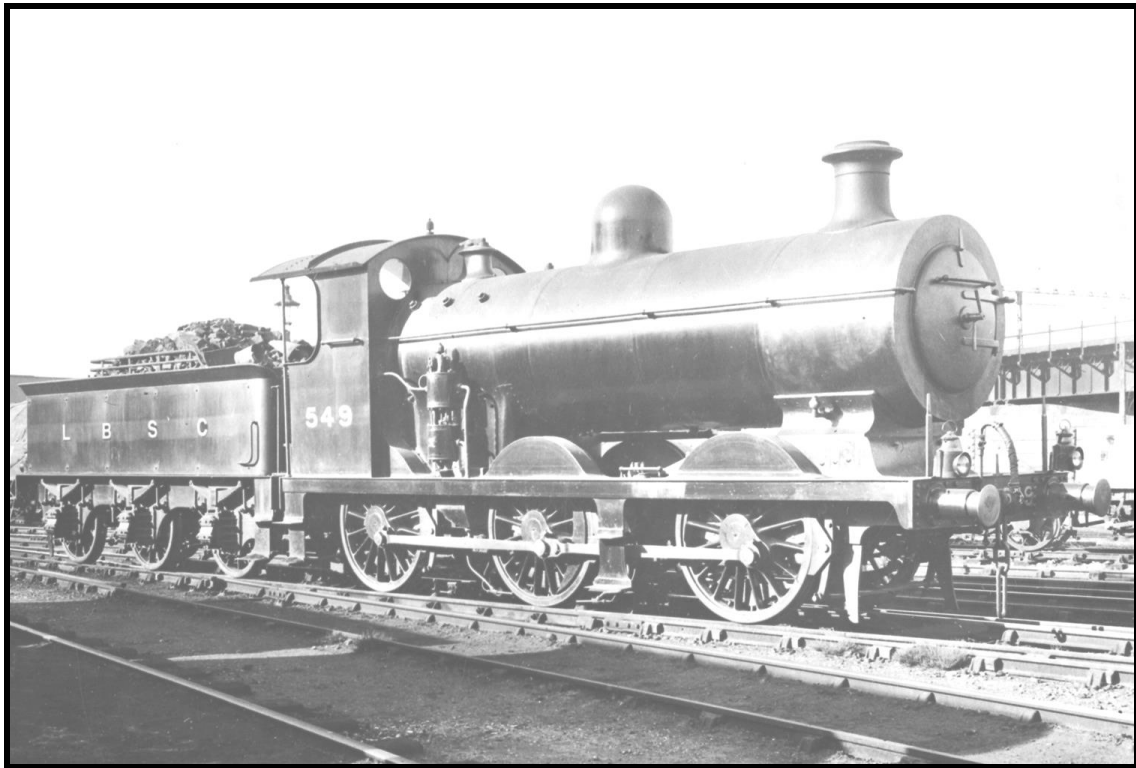
LBSC 549, C2X class, @ Battersea (69719)