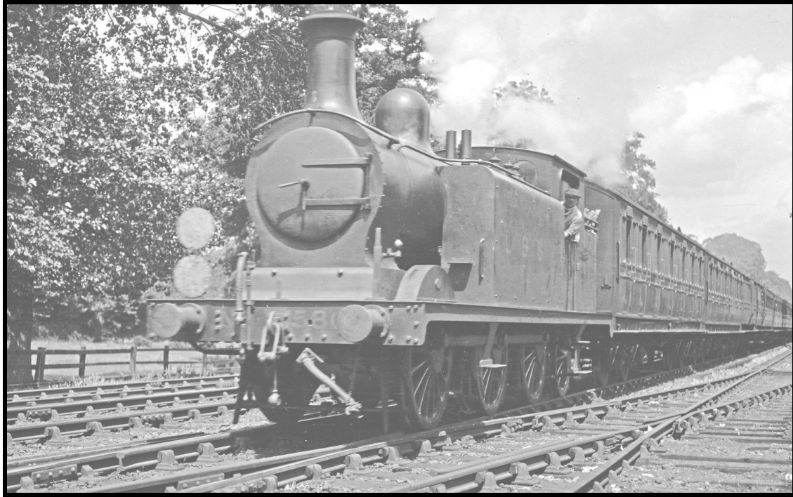
LBSC 580, E4 class (69686)