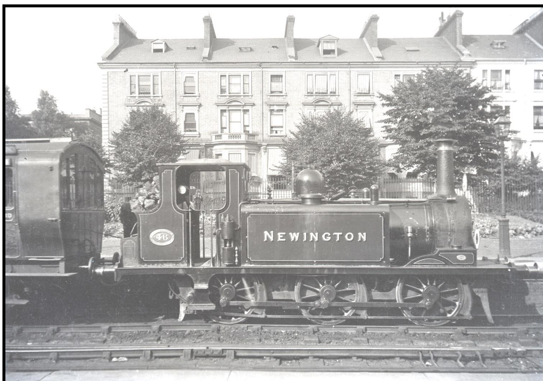
LBSC 46 'Newington' at Kensington, Addison Road (13906)

LENS OF SUTTON ASSOCIATION List 30 (Issue 1 January 2014)